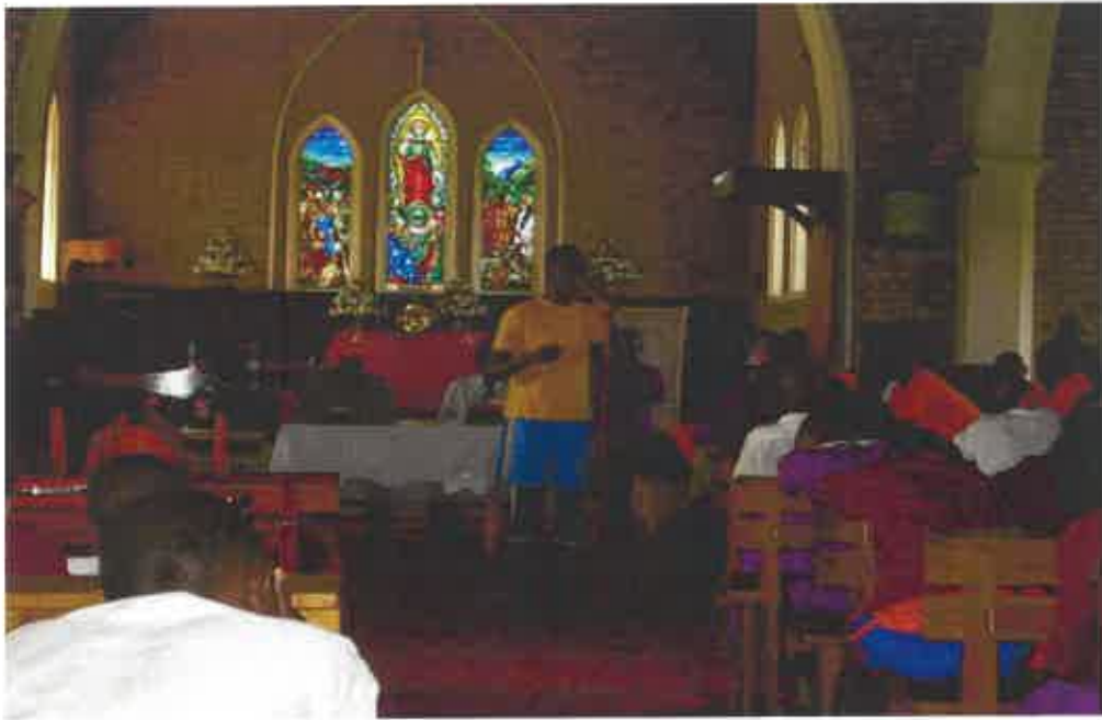
A pupil leading prayers in children worship in the Cathedral