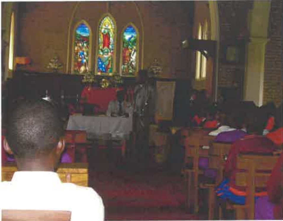
The priest preaching to school children in the cathedral