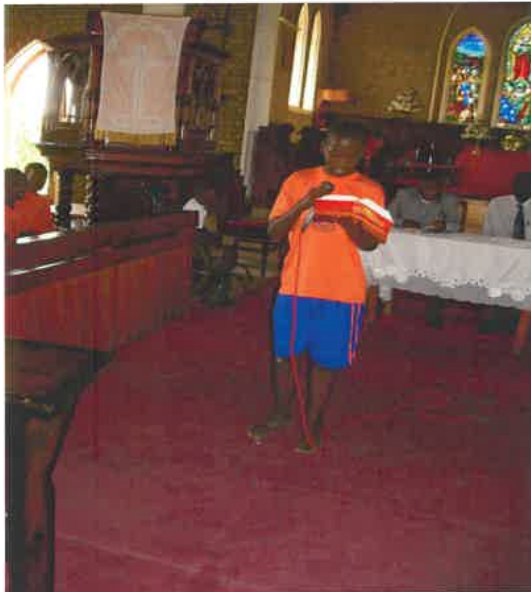
A school child reading the Lesson