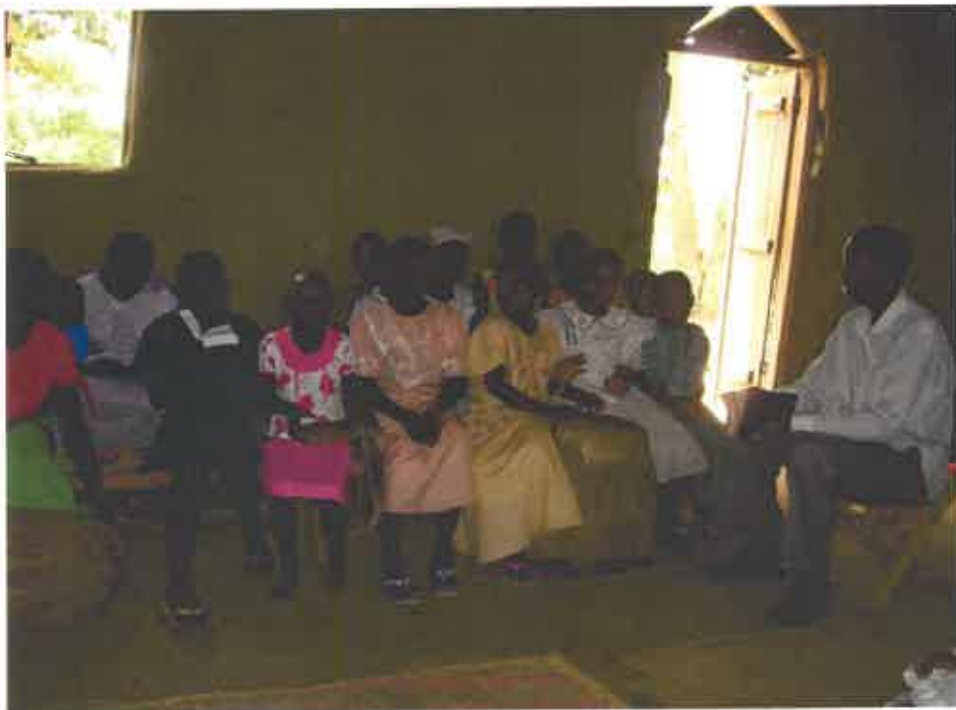
A Sunday School teacher with his children in a local church Ibanda Archdeaconry