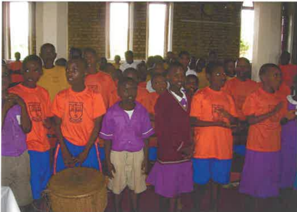
Praise and worship team