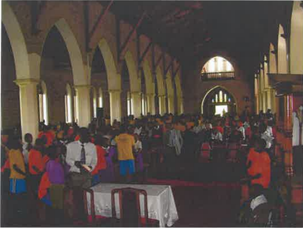
The Priest in procession of the school children's service in the cathedral