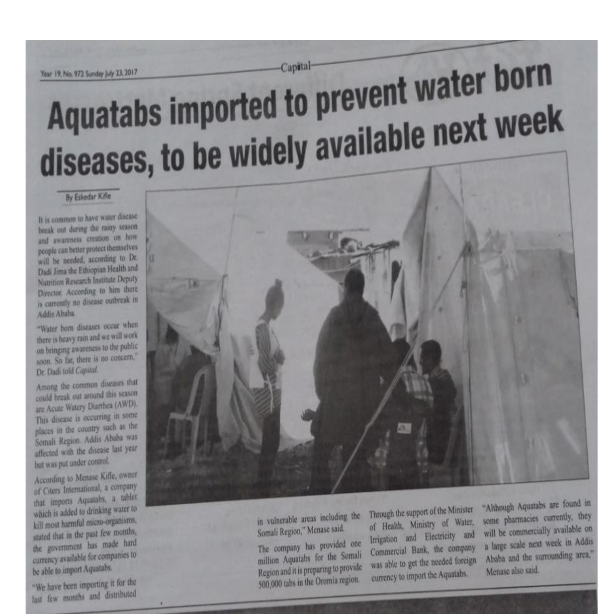
Appendix 3. Aquatabs Imported to Prevent water borne disease