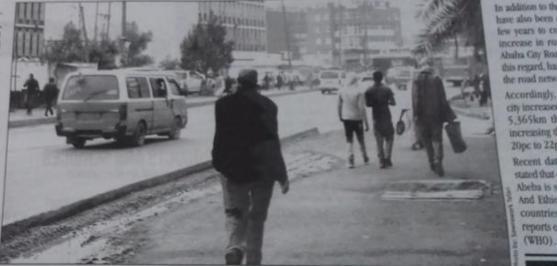
Walking on the right side of the road will be among the faults of pedestrians that are to be punishable by the new

conduct trading activities on sidewalks.