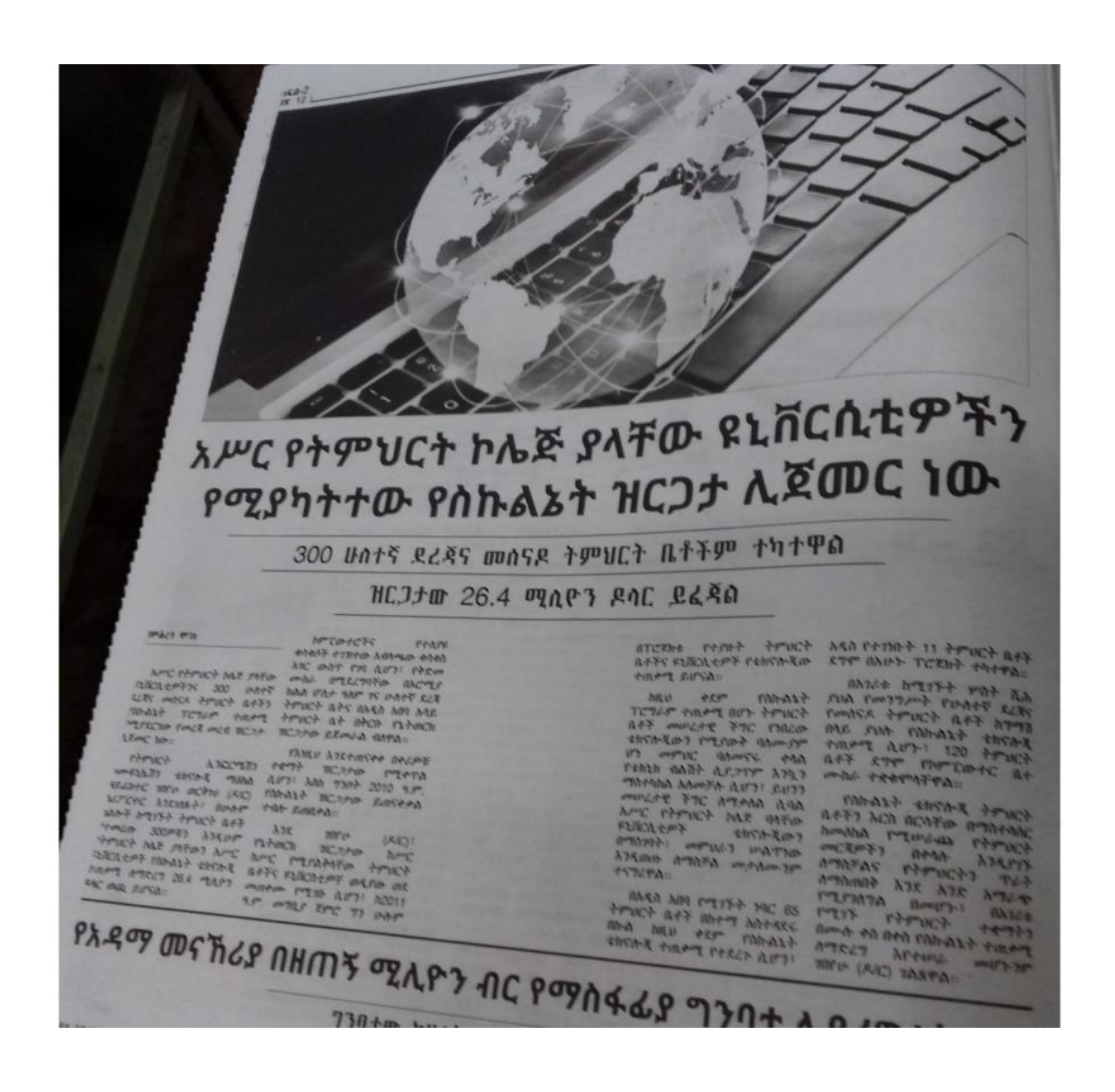
Appendix 5 – Ten college of Education