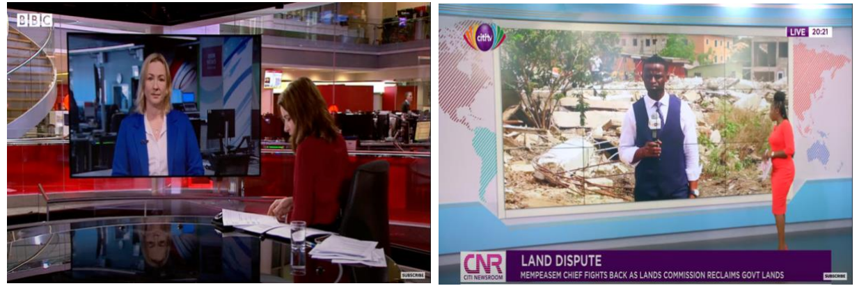
Figure 4.5:Interations with journalists on the field (screenshots of news bulletins on YouTube/Facebook).

This finding further speaks to the extent to which international media agencies influence the structure of news production at the local level. Thus, the introduction of these forms of news presentation by media organizations at the local level has been as a result of the impact of international media on the content and structure of news production and distribution (Pavlik, 2000; Zhang, 2008). The images below, highlight the similarity between the international media and the local media as regards news presentation structure. This was observed to have replaced voice-over narrations which indicates an element of news presentation that has been replicated from Western media giants.