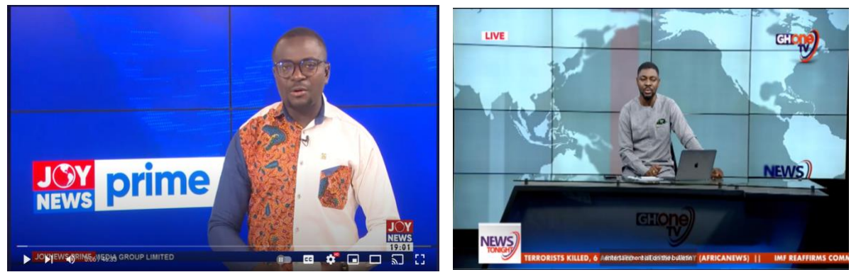
Figure 4.3: Ghanaian male news anchors dressed in traditional Ghanaian attires (screenshots of news bulletins on YouTube/Facebook).

However, the study discovered that not all the Ghanaian male news anchors were in suits. A few of them dressed in traditional Ghanaian attires. This noticeable departure from the dominant dress code adopted by the international media and most of the Ghanaian television broadcasters sampled for the study, is argued by Chalaby (2003) as a consequence of international news agencies, which challenges and tears apart the relationship between traditional news broadcasting and the cultural identity of a people.