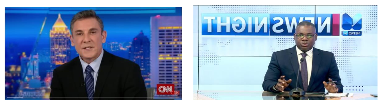
Figure 4.2: Dress codes of news anchors from Ghanaian television networks and international news agencies (screenshots of news bulletins on YouTube/Facebook).

In particular, it was observed on one hand that the choice of dress, and the colour of dress used by the female Ghanaian television anchors were very similar to the dress code of the female news anchor from BBC, while on another hand, the male news anchors from both the Ghanaian local television stations and CCN were in suits. This correlates with the findings of Pavlik (2000) who discovered that one aspect of news production largely influenced by international media is the arrangement of newsrooms, appearance and news production process. As a result, Pavlik (2000) emphasized that international media organizations have exerted a significant impact on the content, style, and structure of news production.