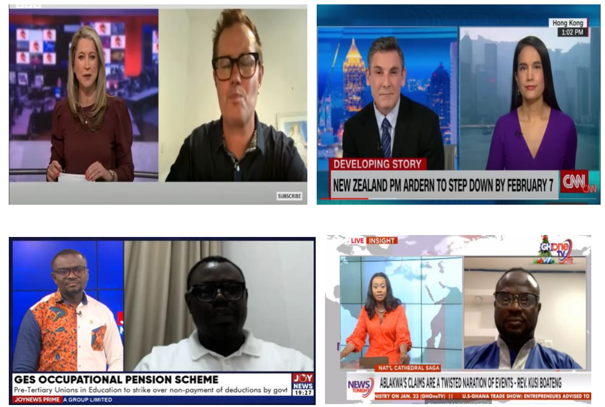
Figure 4.4: Live interviews (screenshots of news bulletins on YouTube/Facebook).

Additionally, the study found that local news media presenting was modelled after global media use of expert sources who are contacted and interviewed live on set. The study found this as a dominant feature which was adopted across a majority of the local news media organizations in Ghana. The study found that one core area of adaptation from global media that the selected local media organizations had engaged in was the use of live interviews with expert sources during the news bulletin. As argued by Matos (2012), as a result of the increased influx of conent from imnternational media organizations, news production at the local, tend to mimic or contextualize the conent and structure of these international news agencies.