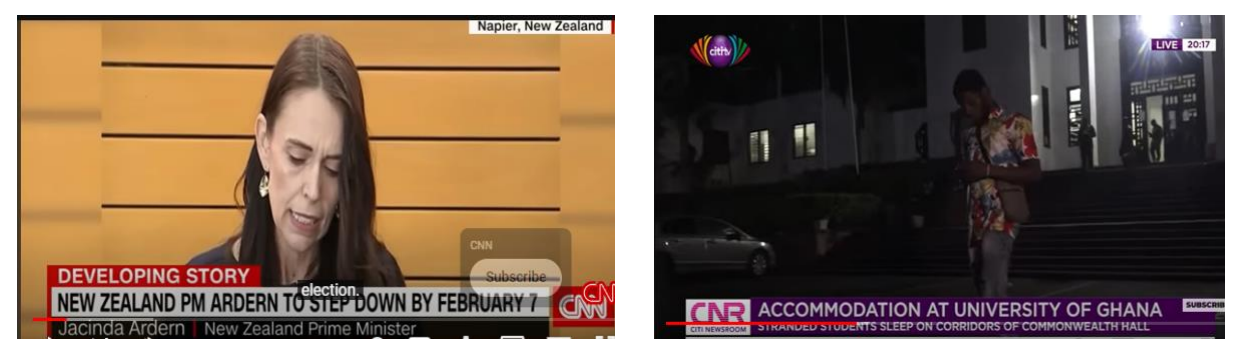
Figure 4.6: Use of dynamic slugs (screenshots of news bulletins on YouTube/Facebook).

The study observed that for both the international media agencies and the local media under study, the content of slugs changed frequently and did not remain static while speakers interacted on the news program. As and when was necessary, new information that was deemed essential was included in slugs and shown to audiences. The contents of the slug were updated as frequently as possible to reflect the topical issues being discussed. This was present in both BBC and CNN as well as all the Ghanaian television stations sampled for this study.