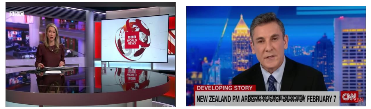
Figure 4.1: News anchors from selected Ghanaian television networks and international news agencies (screenshots of news bulletins on YouTube/Facebook).

The graphic extract in figure 4.1 above, shows pictures of local media organizations using singular news anchors for prime-time news presenting. The extracted pictures show just one news presenter which is similar to the news presenting styles used by CNN and BBC.